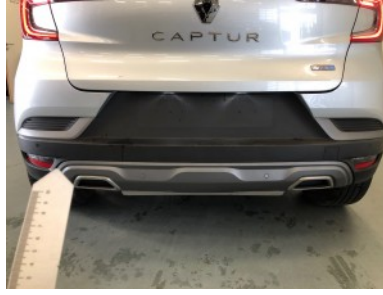
Rear bumper - Scratch