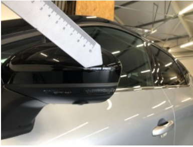
Left outside mirror - Scratch