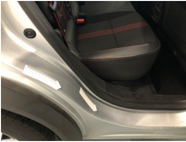
Rear right door - Restyle dent