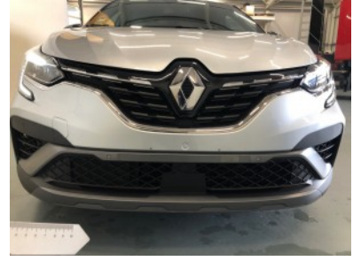
Front bumper - Scratch