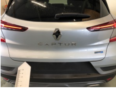
Tailgate/ lid - Scratch