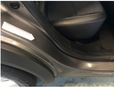
Rear right door - Restyle dent