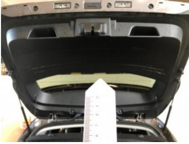
Achterklep bekleding krassen