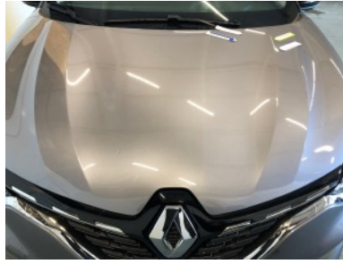
Bonnet - Hail damage