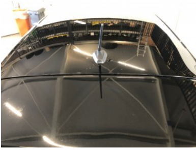
Roof - Hail damage