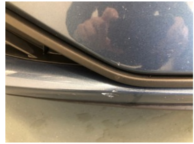
Front bumper - Stone chippings