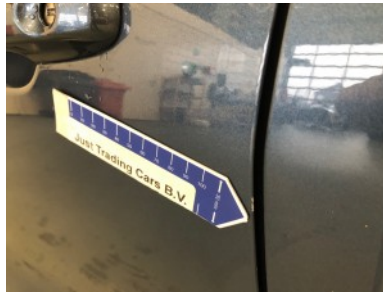
Front left door - Scratch