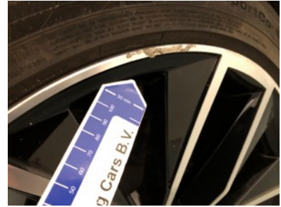
Rear right rim - Scratch