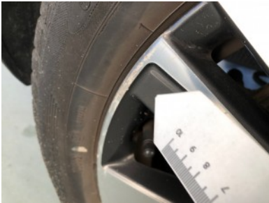
Rear right rim - Scratch