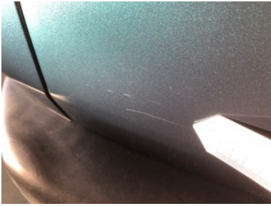
Tailgate/ lid - Scratch