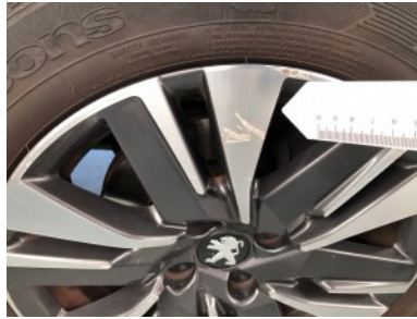
Front right rim - Scratch