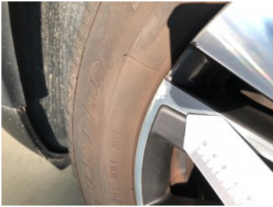
Front left rim - Scratch