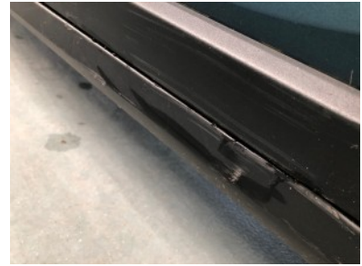
Right sill - Scratch