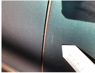
Rear left door - Scratch