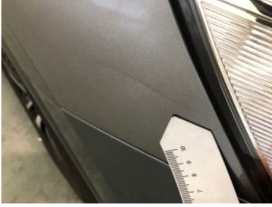
Front left screen - Dent