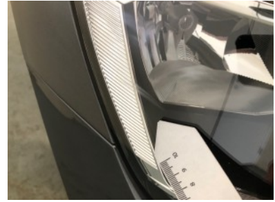
Right headlight - Scratch