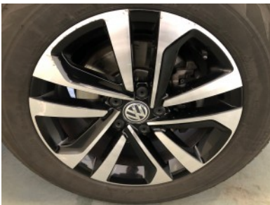
Front right rim - Scratch