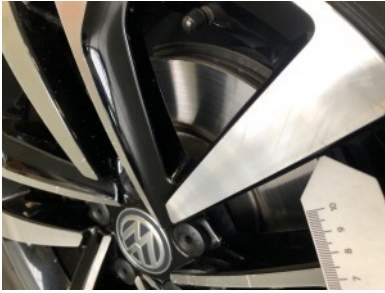
Front left rim - Scratch