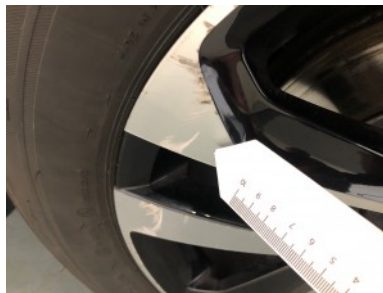
Front right rim - Scratch