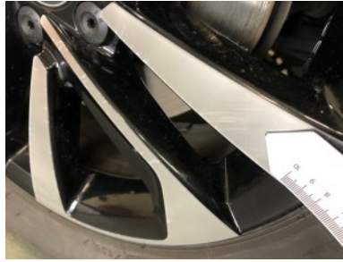
Front left rim - Scratch