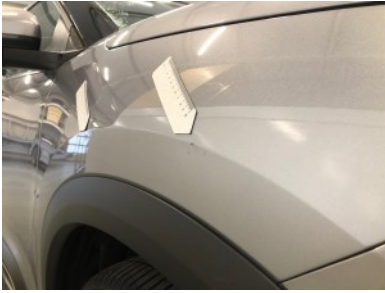
Front left screen - Restyle dent