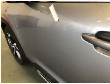
Front left door - Restyle dent