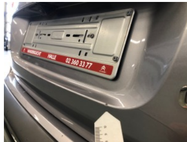
Tailgate/ lid - Scratch