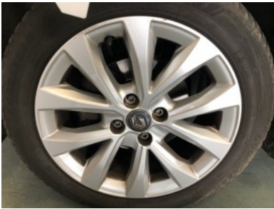
Front left rim - Scratch