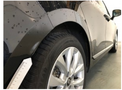
Rear bumper - Scratch