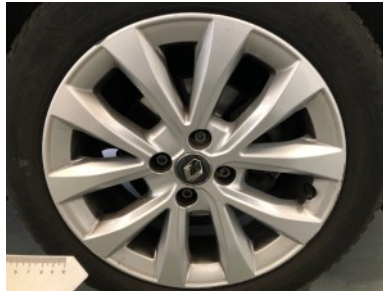
Front right rim - Scratch