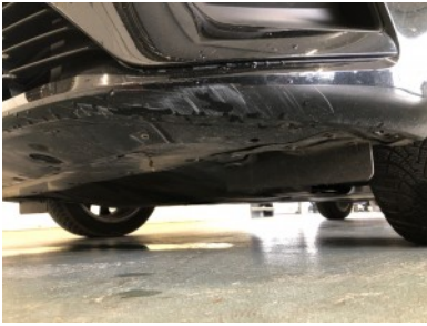
Front bumper - Scratch