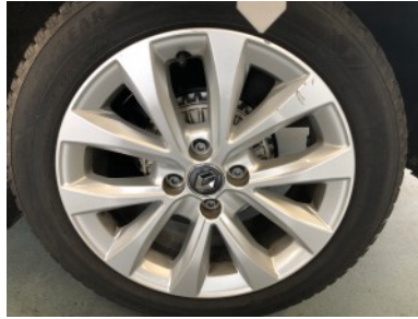
Rear left rim - Scratch