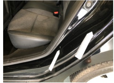
Rear left door - Restyle dent