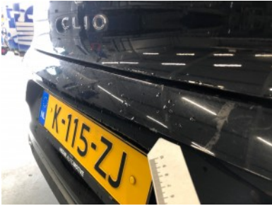
Rear bumper - Scratch