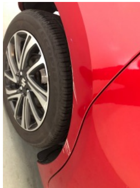
Rear right screen - Paint repair