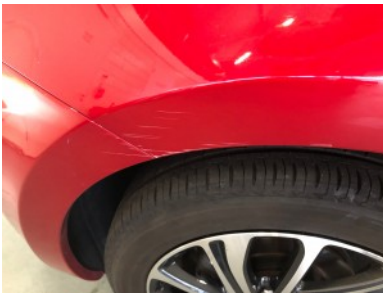
Front left screen - Paint repair