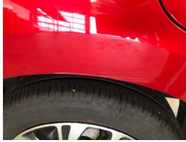
Rear left screen - Paint repair