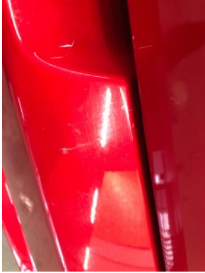
Rear bumper - Paint repair