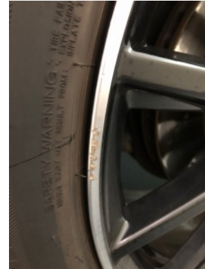
Front right rim - Scratch