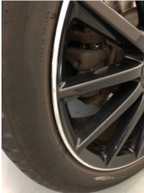
Rear right rim - Scratch