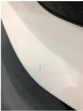
Front bumper - Scratch