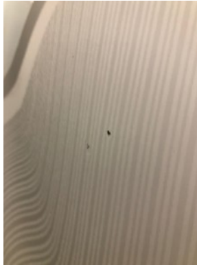
Rear right door - Dent