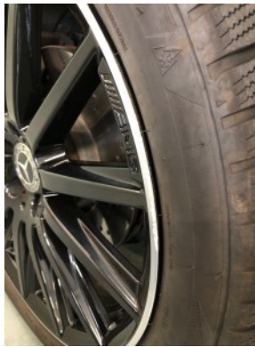
Front left rim - Scratch